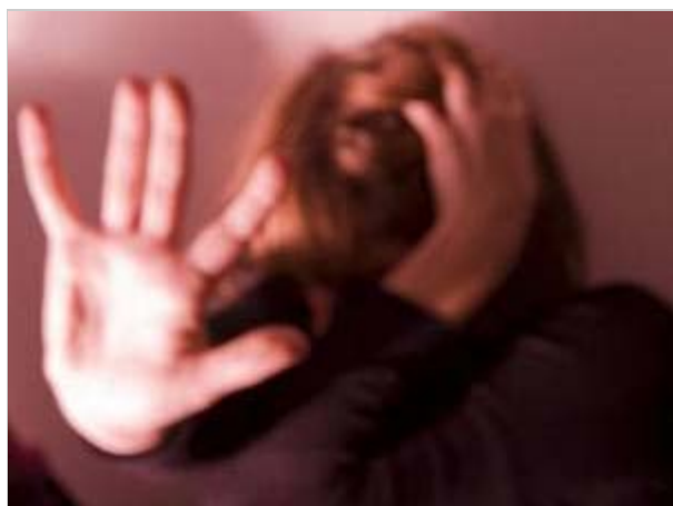
Nigeria has cue to 200 abducted girls