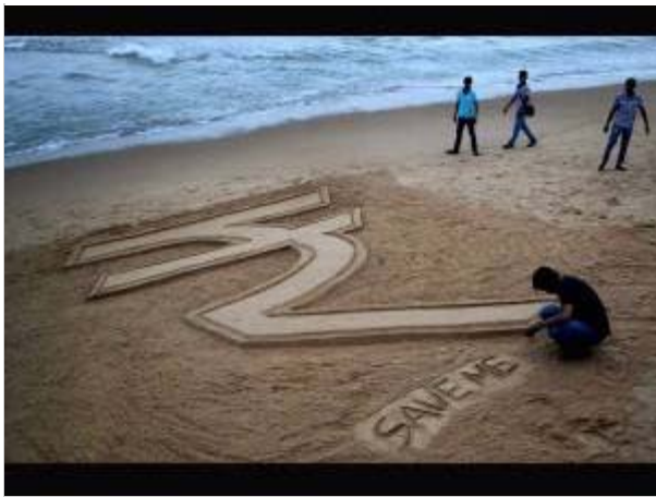
Rupee rallies high vs USD at 59.51