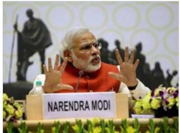
Go out and vote: Modi tells youth