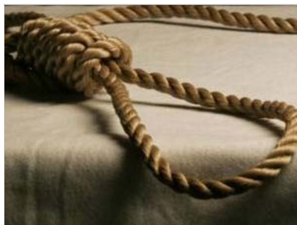
Honour killing: Girl killed, body hanged