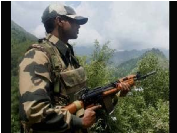
812 security guards for 84 VIPs in Maha Rahul gets 3 more days to respond to EC