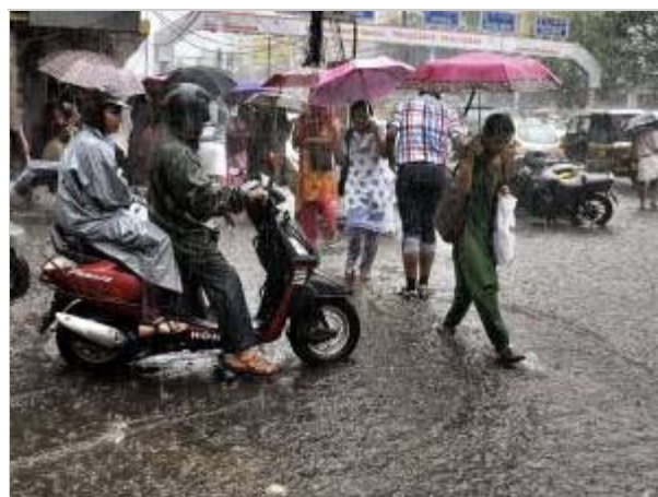
Storm hits North Bengal, highway blocked