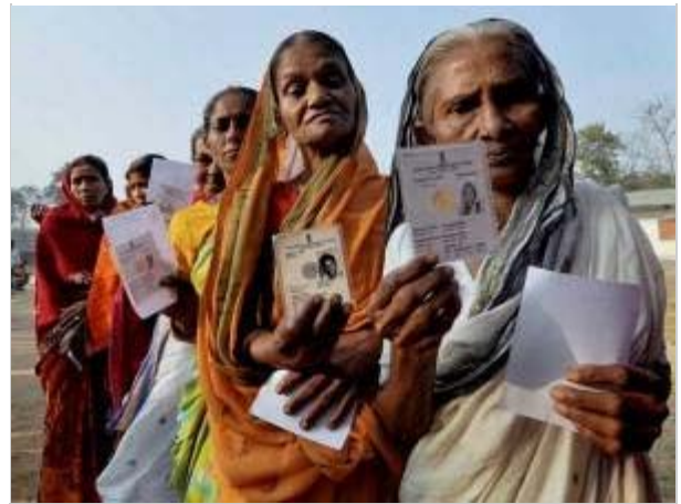
Long queues at Bihar poll booths