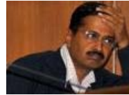
Now Kejriwal writes to Rahul Gandhi on Reliance gas price issue