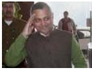
AAP leader Somnath Bharti attacked in Varanasi