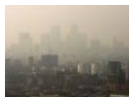
World's most polluted cities