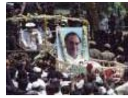
Rajiv Gandhi assassination: SC to hear Centre's plea on February 27