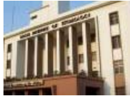
Fire in IIT Delhi hostel room