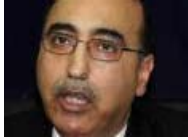
Very much welcome Modi statement on relations: Pakistan envoy More »