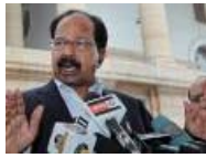
Moiy writes to PM, defends gas pricing deal with Reliance