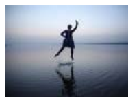
Best pictures of the week: May 9, 2014