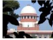
Apex court seeks Centre's reply on AAP plea against President's Rule in Delhi