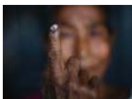
India: The biggest election the world has ever seen