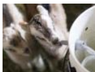
Weird news of the week, May 9, 2014