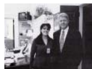
The Monica Lewinsky scandal