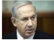
Decide between peace with Hamas or Israel: Israeli PM to Abbas