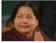
TN to counter Centre's review plea on convicts' release