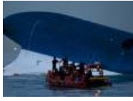
Children's bodies in ferry reveal desperate attempts to escape