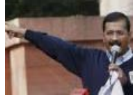
Kejriwal, Modi top Time magazine's poll