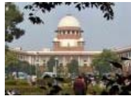
SC forms panel over government advertisements